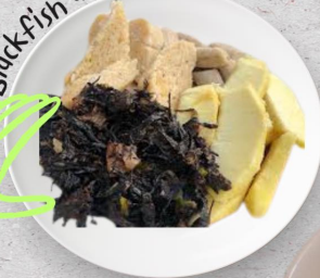
Blackfish and Provision

Creole Saturdays each and every Saturday