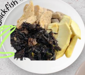
Blackfish and Provision

Creole Saturdays each and every Saturday