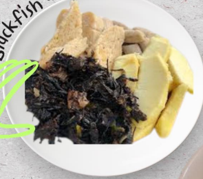
Blackfish and Provision

Creole Saturdays each and every Saturday